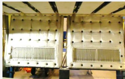
heat shields to reduce heat loss

With over 30 years of experience in SPF and HF presses, Aries Alliance has developed high efficiency heat shields , that keep heat losses to a minimum while reducing temperature recovery time and improving temperature homogeneity in the press.