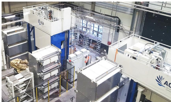
fully automated turnkey work cell installation

Aries Alliance has developed a range of solutions with different levels of automation to preheat and cool the die outside the press then load it in the press at or near forming temperature. It now takes less than 10 minutes to change 5 to 10 tons dies heated to 750°C (1380°F) .