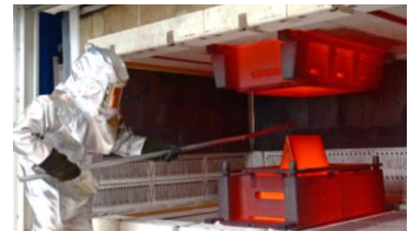
dual HF/SPF process